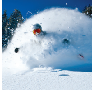
TRANSIT BUS AND TROLLEY / FAMILY SKIERS